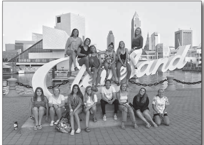
These are the 14 I-LYA sailors who participated at the US Sailing Junior Women's Doublehanded Championship at Mentor Harbor Yachting Club.

I-LYA thanks all the volunteers who made these events possible.